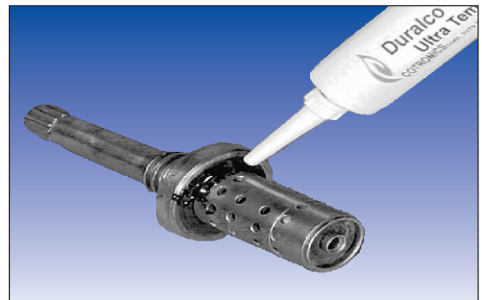
4703 Repairs a Valve Seal